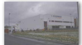
Warehouse in Friedewald

We also noticed that our investment in a local warehouse in Germany since 2007 has really created a lot of interest, and we are looking forward to developing this market.