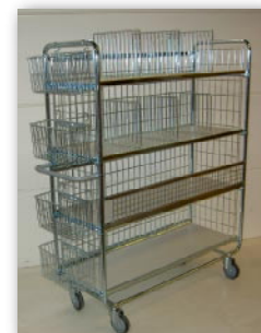
PS. This is a standard trolley with accessories!