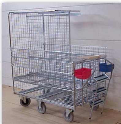
Trolley for Order Picking

Please feel welcome to put us to the test!