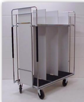
Trolley for Paintings