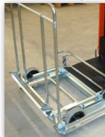
Adapter for Pick-train